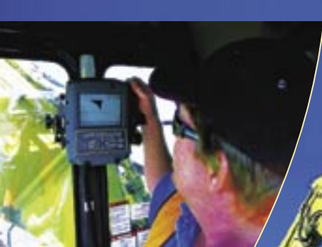
Using GPS to control machinery on the Port of Brisbane Motorway

Nevertheless, the floodplain/wetland problem around the Bulimba Creek Oxbow was particularly difficult for the Alliance. Rehabilitation of the area was an objective of the Alliance from the outset of the project (following ministerial commitments and advice contained in an earlier Impact Assessment Statement). The TCE included an allowance for a feasibility study. However, environmental groups were keen to see a fuller commitment to rehabilitation of the Oxbow area as part of the POBM project. Indeed, the area was already significantly degraded and the motorway works could easily have exacerbated the problem.