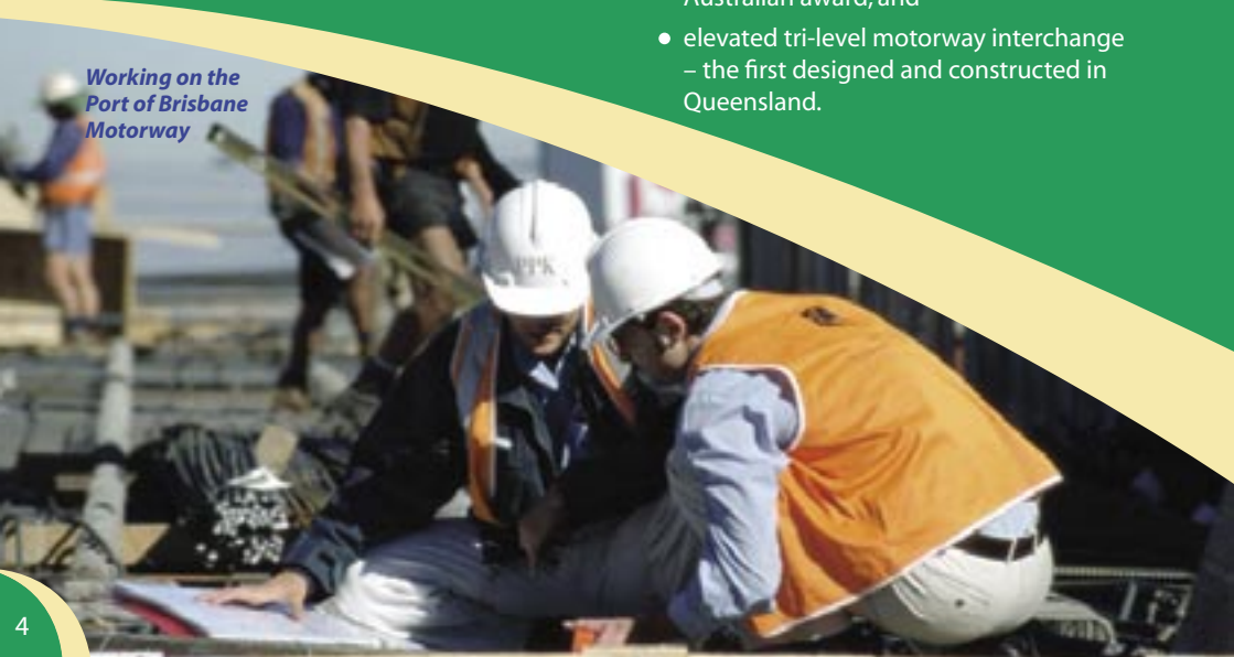
Working on the Port of Brisbane Motorway